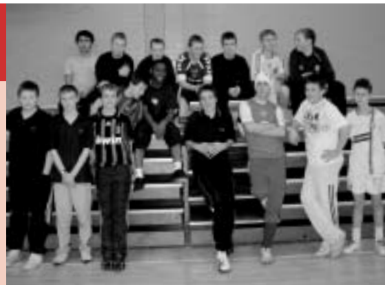
Above: Children from neighbouring areas in Wester Hailes have been breaking down barriers via the medium of football

The group will be finishing off this first stage of the project by playing a local team in Sighthill on 22 December and enjoying watching Hibs vs St Mirren on 23rd December.